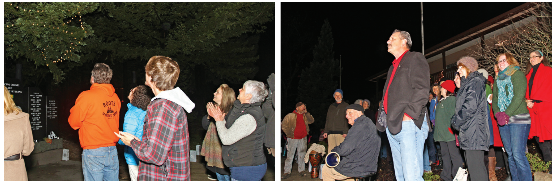
Above, left: Attendees applaud as the Christmas tree lights come on.