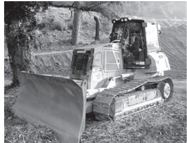
Above: On the southwest slope of Oil Well Hill, a state bulldozer is parked at the site where fill dirt is being packed in and shaped at the base of a steep slope.

Volunteers Needed Come meet wonderful people and make a difference in your community. Pick up an application at the Harrah Senior Center on Baechtel Road. Hope to see you soon.