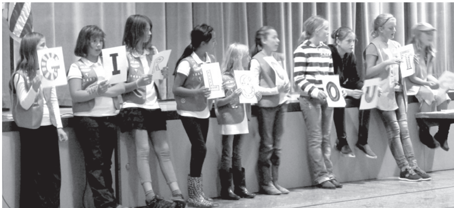
Left: Girl Scouts mid-song hold up letters as they sing about each letter.