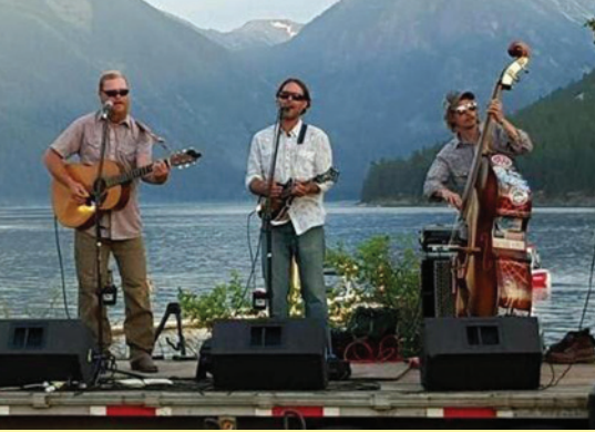
Moonshine Mountain Band from Montana