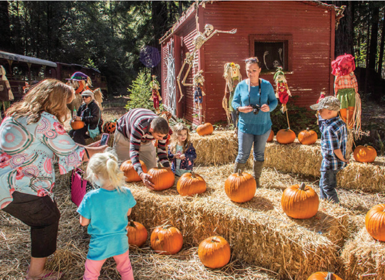
Far left: The mighty diesel-electric GP-9 locomotive pulls the Skunk Train along the tracks.