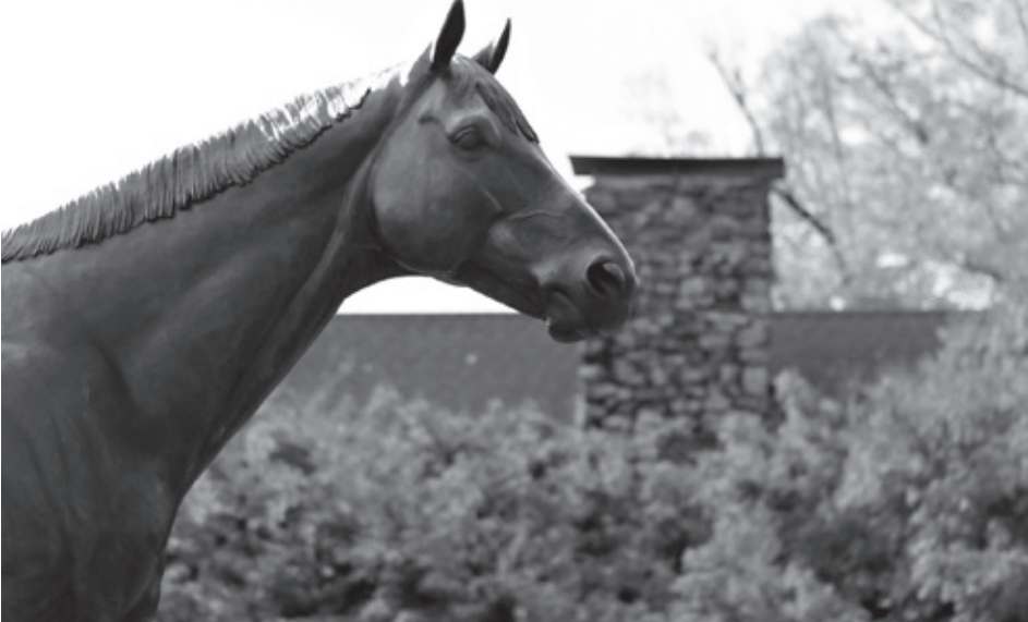
Bronze statue of Seabiscuit.

The Redwood Empire Lions Club and the Seabiscuit Heritage Foundation, located at historic Ridgewood Ranch, home and final resting place of the horse racing legend, Seabiscuit, are gearing up for "Black Bart Strikes Again!" a day of family fun to promote tourism in Willits on Saturday, October 14. This public benefit event is sponsored by Frank R. Howard Foundation, Mannon, King & Johnson, Baechtel Creek Inn & Spa, Sparetime Supply, and SHN Engineers & Geologists, Inc.