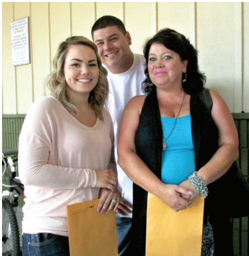
Far left: The front of the line on Friday.