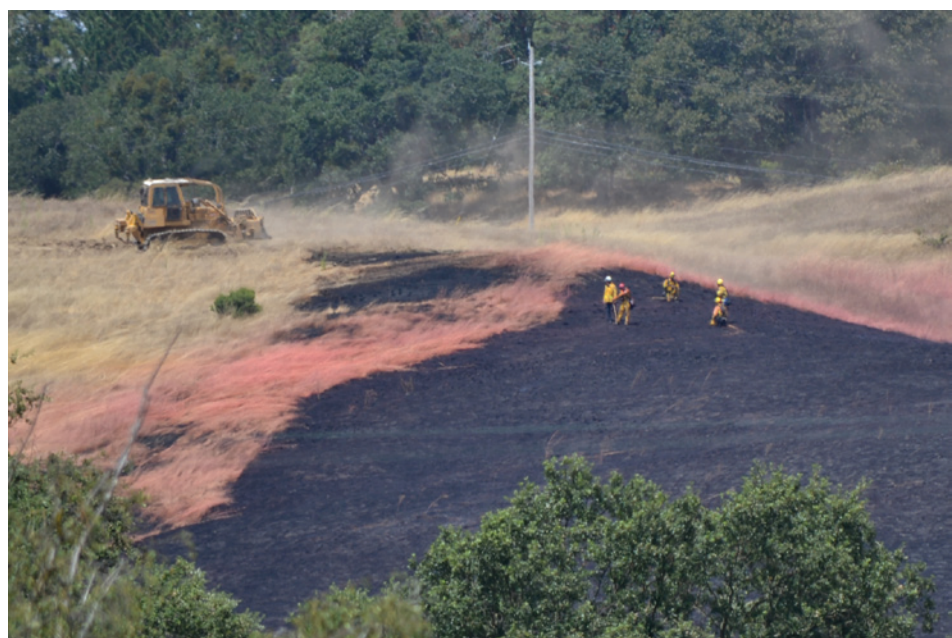
The rest of Fire | From Page 1

Schoepner said. "When CAL FIRE showed up, we turned it over to them, to finish up the mop up." The airport fire ended up burning about 1/8 acre.