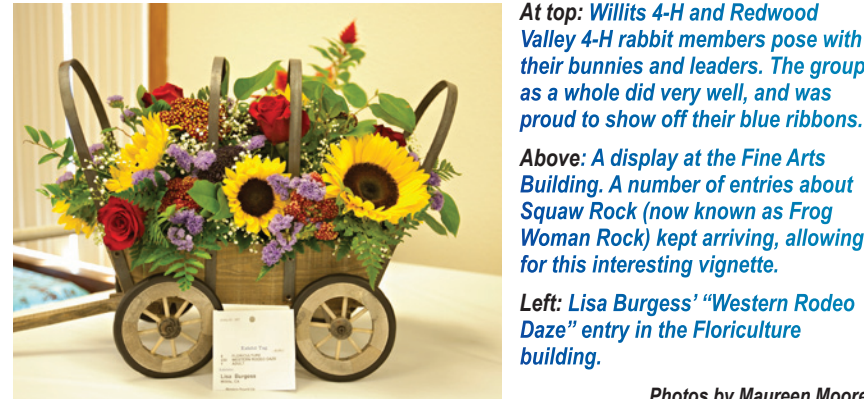
At top: Willits 4-H and Redwood Valley 4-H rabbit members pose with their bunnies and leaders. The group as a whole did very well, and was proud to show off their blue ribbons.