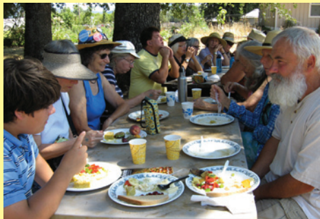
WELL Garden Tour participants enjoying lunch at the Willits Integrated Services Center garden last year.