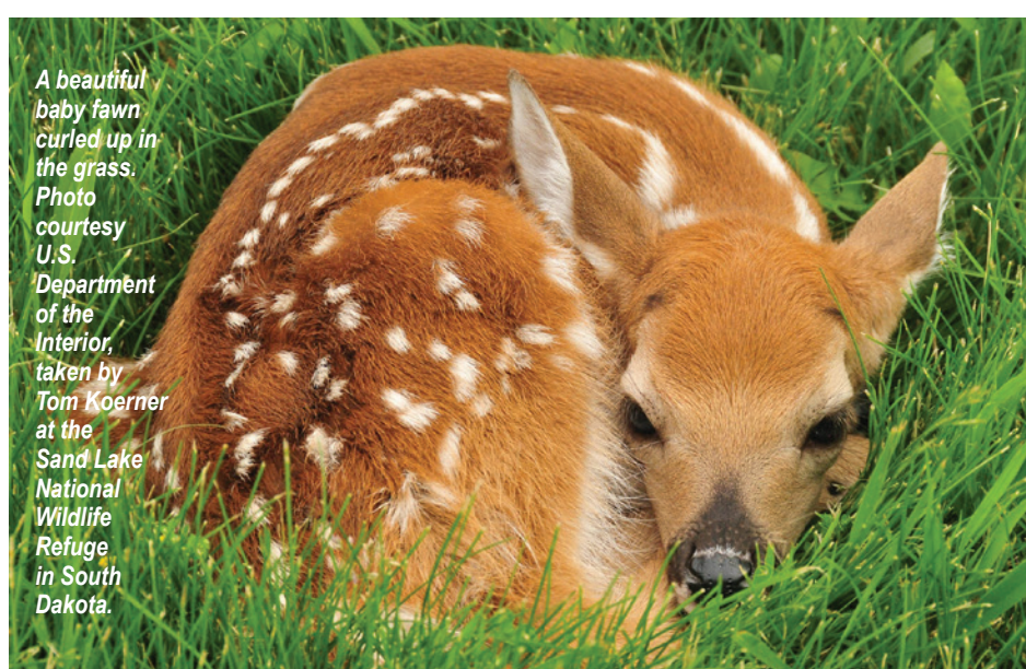
A beautiful baby fawn curled up in the grass. Photo courtesy U.S. Department of the Interior, taken by Tom Koerner at the Sand Lake National Wildlife Refuge in South Dakota.