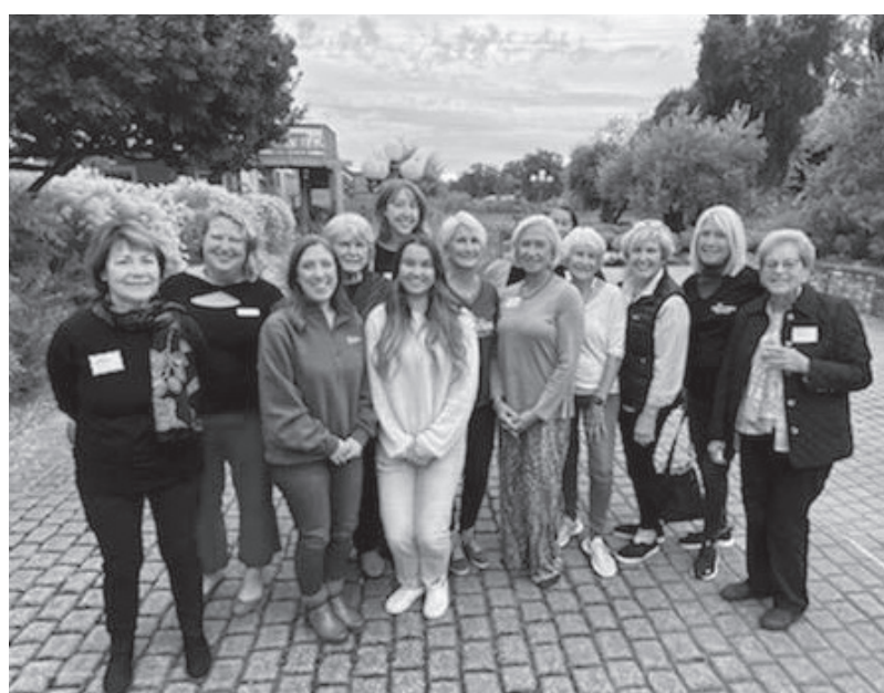
Above: 100+ Women Strong volunteers gather for a photo.

Read the rest of 100 Women | Over on page 11