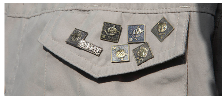
The rest of Scouts | From Page 1

kids. In this truncated year, the Scouts' rank-up ceremony was finally able to proceed on February 27 (at the soccer fields), albeit in a socially distanced and masked manner.