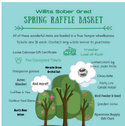
Above: WHS Senior Callie Brown holds tickets for sale. Below, from left: The poster for the Spring Raffle Basket lists the items included in the wheelbarrow. WHS Senior Teo Labus holds one of the potted flowers that will go to the winner of the wheelbarrow. The margarita glasses will be perfect for summer drinks once the weather warms.