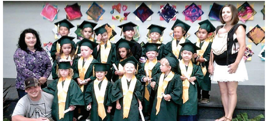
Room to Bloom Preschool class of 2013