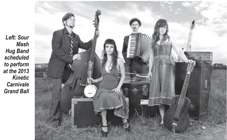
Left: Sour Mash Hug Band scheduled to perform at the 2013 Kinetic Carnivale Grand Ball

Kinetic Carnivale Construction Volunteers: Work parties on Thursdays from 5:30 to 8:30 pm, and on Sundays from 11 am to 4 pm. Bring your friends and bring your tools to the Mendocino County Museum, 5:30 to 8:30 pm. Volunteers get perks and free passes to the Carnivale. More info: 684-0738, or http://www.kineticcarnivale.com/ or the Kinetic Carnivale page