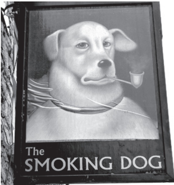
The sign for one of Rohlicek's favorite pubs in England

Fortunately, for the rest of us, it's possible to eat world cuisine without working for Princess Cruise Lines. One only needs to stay in a country with a large and varied immigrant population ... such as England or the United States.