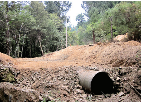
At right: The "Big Dig" on Ryan Creek