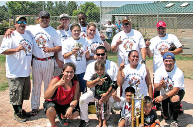
The Round Tree Glass first-place team shows off their trophy and the 'cold, hard cash' they won, which team members donated back to the scholarship fund.