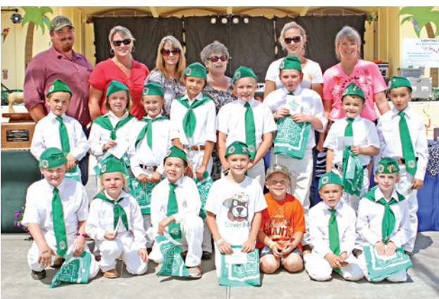
Above: Cloverbud members receive their first- and second-year gifts.