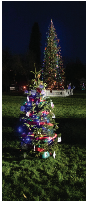
At top, left: The Little Lake Fire Department's decorated tree. At top, right: A couple hundred people gather in City Park to enjoy the lighted trees and tasty sweets. Above: Attendees peruse the wreath table of the Baechtel Grove PTO. At right: Trees decorated by the community stood in front of the large tree placed in the park by the City of Willits. Below, left: A neighborhood Santa shows up to pass out homemade cookies. Below, right: As night falls, the lights on the trees create a festive Christmas scene.