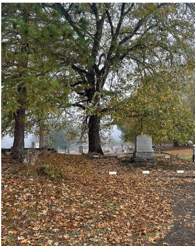
Below: A before and after set of photos showing the tidy-looking grounds after the expert trimming, raking, and cleaning up of Beck and Hensley of All Things Trees.

If you are interested in donating time to help clean headstones, repair broken stones, rake, weed or do other helpful tasks, contact or leave a message for Ramos at 707-459-5252 and find out more.