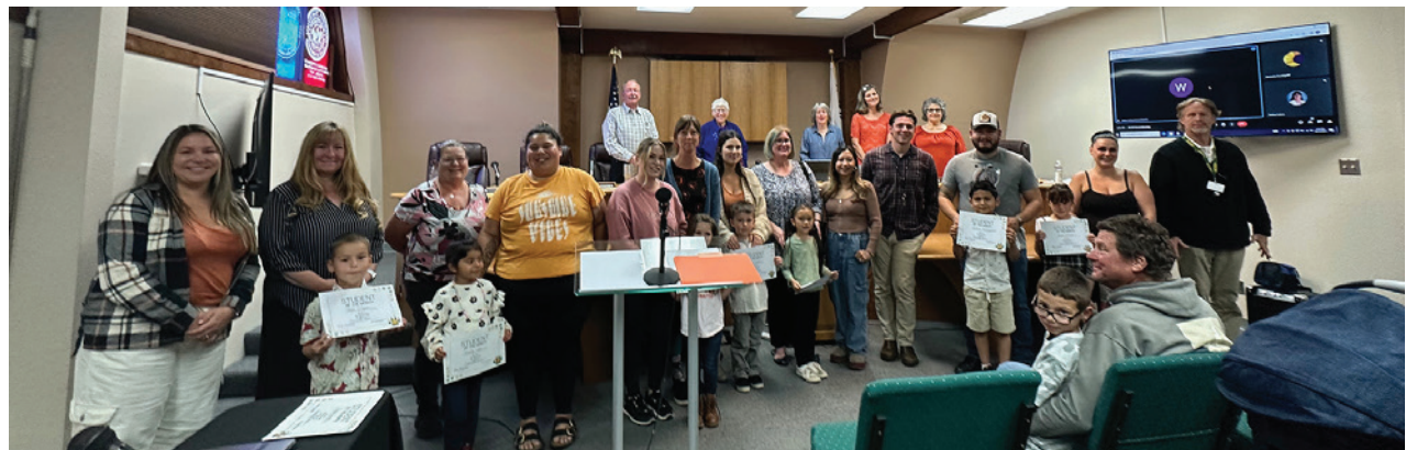
Above: Brookside Elementary School Students of the Month are honored at the October Willits Unified School District board meeting.