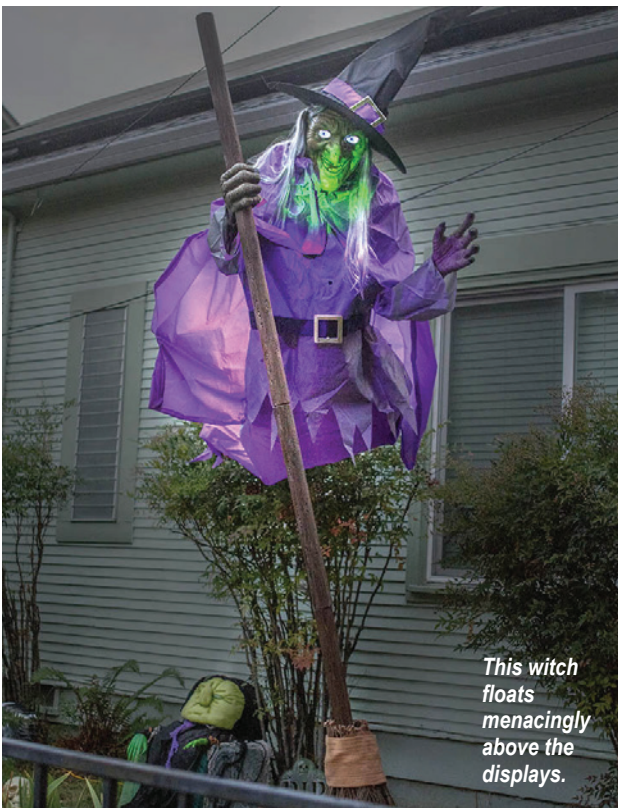
This witch floats menacingly above the displays.