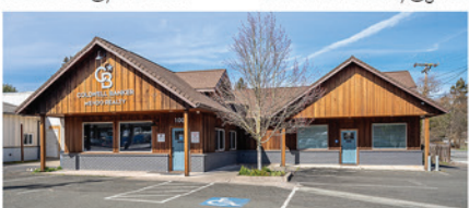
100 South Street, Willits (707) 459-5389 DRE#02116789

Contact one of our experienced agents to find homes for sale in Willits or Mendocino County. MENDOCINOCOUNTYPROPERTIES.COM • COLDWELLBANKER.COM