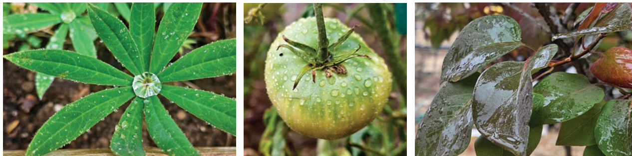
Above: Water collects on thirsty produce and foliage Monday afternoon when the rains started to fall, including the leaves of a lupine, left, and a lilac, right, and a still-green tomato, center. Below: A few chocolate cherry tomatoes received a sprinkle of rain, washing off their dust, exposing their lovely red hue. At bottom: One of the neatest things about lupine plants is how the droplets of water collect into the center, and onto the tiny hairs of their star-shaped leaves.