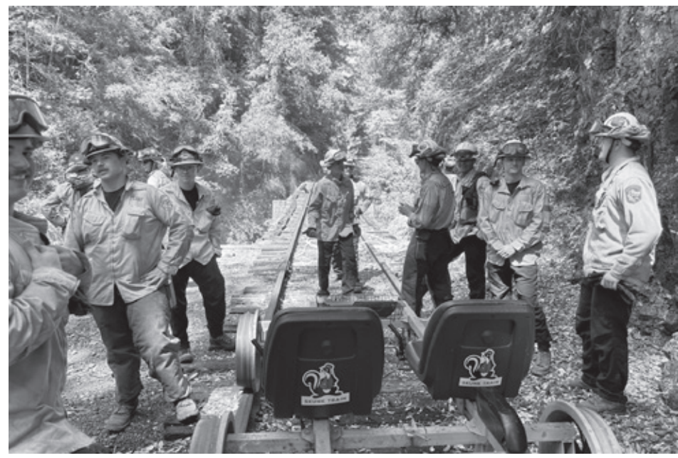
Above: Firefighters gather at the Skunk Train's Bridge 15.03, after a fire was reported July 27. Below: A firefighter wets down the burning ties on the bridge.

On Thursday, August 3, children 6-12 years old and seniors 65 and older are admitted to the fair for free until 6 pm. Children under 5 are always admitted free. Grandstand shows are always included with fair admission. The Redwood Empire Fair opens at 3 pm on Thursday and Friday and at noon on Saturday and Sunday. For more information phone (707) 462-3884, visit the Redwood Empire Fair's Facebook page or https://www.redwoodempirefair.com/summer-fair .