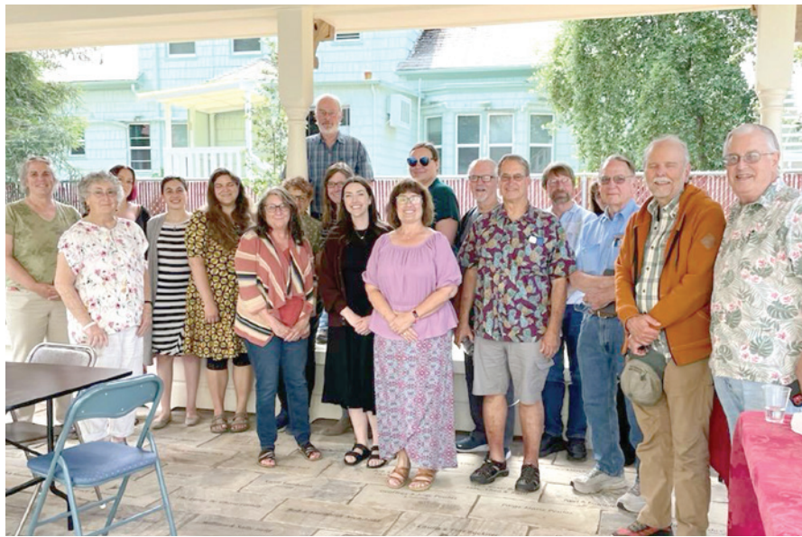
At left: Representatives of local historical groups pose for a photo in the newly completed pavilion located behind the Held-Poage Memorial Home at 100 South Dora Street in Ukiah.