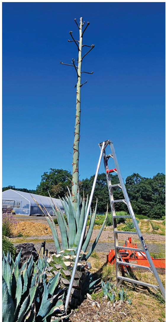
At left: The Blue Agave Century plant (that once stood on the south side of the Willits Cafe but planted now at the Commonwealth Garden) is just about ready to bloom, shooting up a stalk some 25 feet into the air. Below, from left: Some of the Commonwealth Garden crew including, from left Chris Sissons, Mellisa Bouley, Scott Selzer and Ryan Hartman. Zucchini were a quick sell and took fast hands to grab out of the fridge before they were gone. Further below, from left: Chris Sissons' chocolate chip cookies go just as fast. Mellisa smiles with customer Heidi. The fridge offerings also included cucumbers and beets. At bottom, from left: Ryan and Mellisa try to foil gophers hiding in the lettuce patch. A giant basket of snap peas were available to purchase. The first two customers at the first Commonwealth Garden farm stand cheered just before the gates opened for the sale's return for the 2023 season.