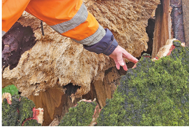
Above, left: Caltrans workers rake up bark, branches, and other remnants from the northbound lane of Highway 20/Main Street after a large oak crashed and fell Tuesday morning. Above, right: Caltrans supervisor Jaron Nunnemaker noted the whole interior of the oak's stump was rotted out, and just the exterior portion of the tree was all that was holding the whole thing up. Below: Heavy equipment was needed to help remove the larger branches. The bumper of the car which made a non-injury contact with the tree was still sitting on the sidewalk. Nunnemaker estimated the tree to be large enough for four to five cords of wood, but with the rot, it wasn't really usable as firewood. "Thankfully it didn't fall into the residence to the east, or straight across the road. That'd mess up someone's morning coffee for sure," said Nunnemaker with a relieved laugh. "It's a good reminder to have your trees checked!"