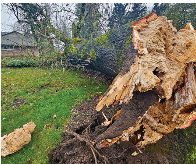
Above: The interior of the oak's stump was the texture of a dry sponge. Below, left: Caltrans workers assess a possible water leak as a puddle grew larger and larger in the lawn, from under the tree. Below, right: This Google Maps view from before, shows the tree in its previous state, before it fell Tuesday morning.