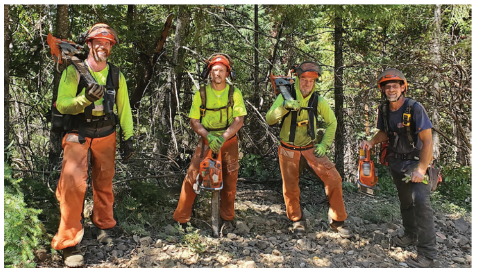
The Elk Ridge Tree Service crew working on some fuel-reduction for the Wildwood Fire Safe Council.