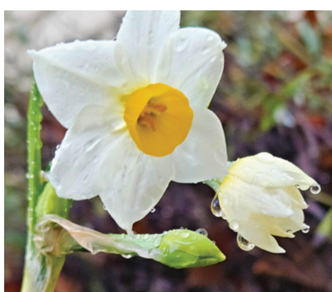
At left: Drops of water cling to the first paper-white flower of the season. Below, left: This little succulent drinks up some water, happy to still be nestled into the fallen leaves. Below, right: The level of water in the "Frog Pond" will usually spill over onto Locust Street during heavy rains.