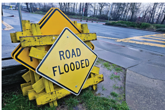
Above, left: Stacked "Road Flooded" signs are ready to be put up, if needed, at the intersection of South Lenore and East Commercial Streets. "Frog Pond," in the low-lying portion of Locust Street, was already past the old fence line, getting closer to the road Wednesday afternoon. Below: Drips from the roof drop into puddles filled with fallen leaves..

The briefing is scheduled for Thursday, January 18 at the Willits Community Center, 111 East Commercial Street. Refreshments served. Everybody welcome!